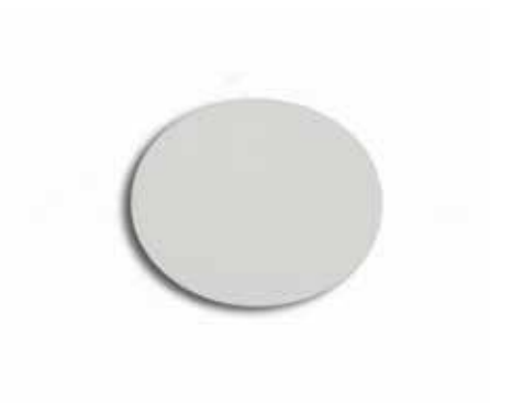
PMD Hydrophobic Filter Disc 1" (Single)