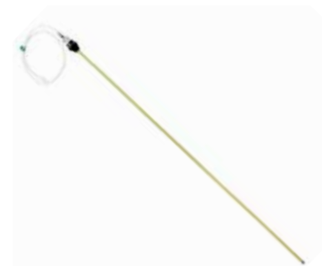
32" Heavy Duty Fiberglass Bar Hole Probe with Hose Assembly